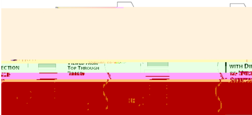
Figure2.Electrical Pin-out Details